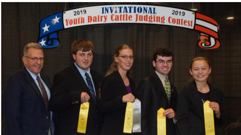
All-American Dairy Show